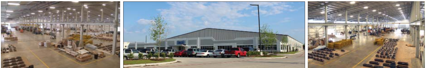
Rilco Headquarters - Tanner Road Location

The new Rilco headquarters is located at 12700 Tanner Road, in Houston, TX. With the additional 120,000 square feet and the strategic setup of production lines, new equipment, additional space and a revitalized focus on efficient manufacturing, we have recently doubled our current production capacity.