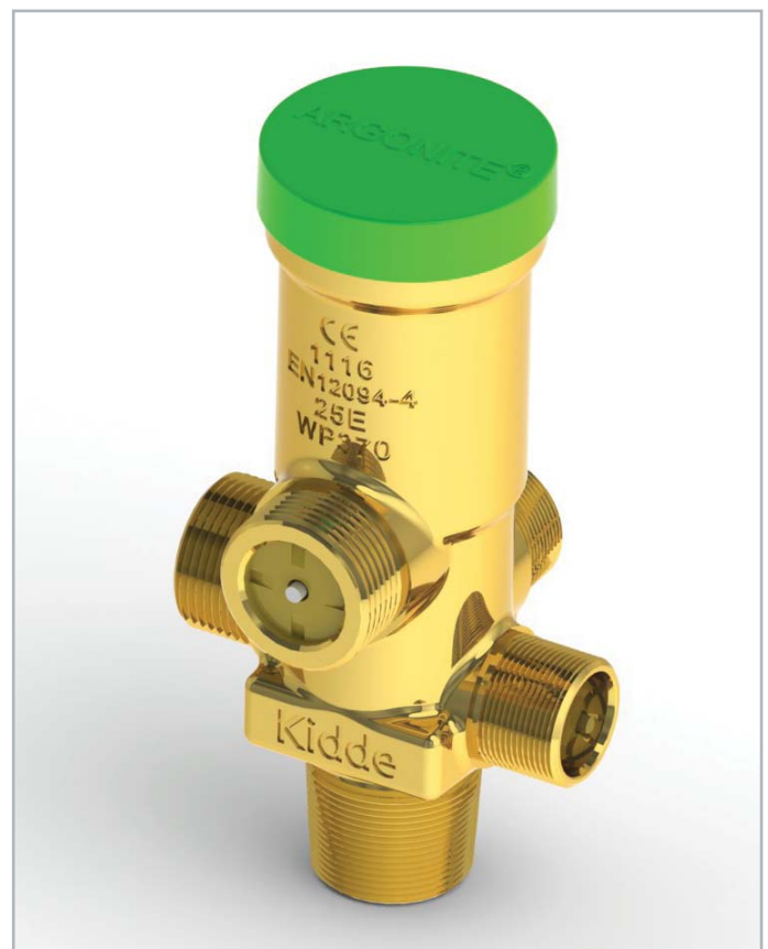
New ARGONITE® C60 Controlled Flow valve

The ARGONITE® C60 System is a major advance on ordinary inert gas fire suppression systems. It uses a unique cylinder valve assembly that significantly reduces the peak mass flow, releasing the gas at a lower and more controlled flow rate throughout the discharge.